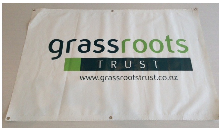
Banner 1 – 88.35cm x 131cm

Signage and event material can be booked by contacting Grassroots Trust.