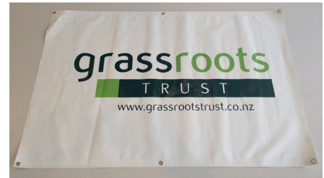
1300mm (W) x 885mm (H)