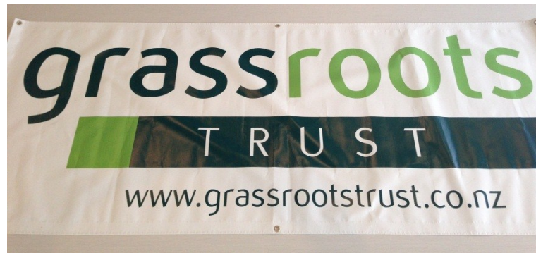
1980mm (W) x 790mm (H)